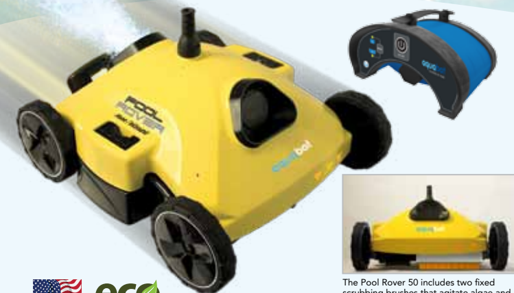
The Pool Rover 50 includes two fixed scrubbing brushes that agitate algae and film on surfaces before the intake port for even better cleaning.