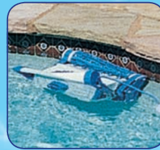
The Eagle scrubs pool walls, waterline and most steps while it vacuums & filters out pool dirt & debris.

Low Maintenance - Constructed of corrosion-proof materials, with fewer than 10 moving parts needing little or no maintenance.